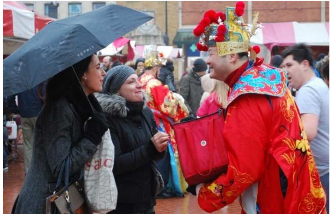
Gods of Wealth – Chinese New Year 2017